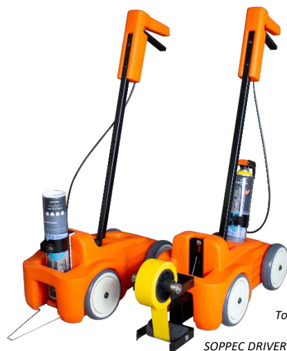
To be used with the SOPPEC DRIVER™ trolley